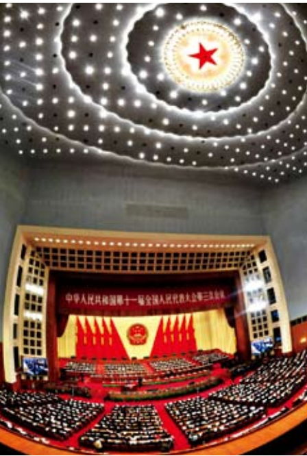
Venue of the 3rd Session of the 11th NPC CFP