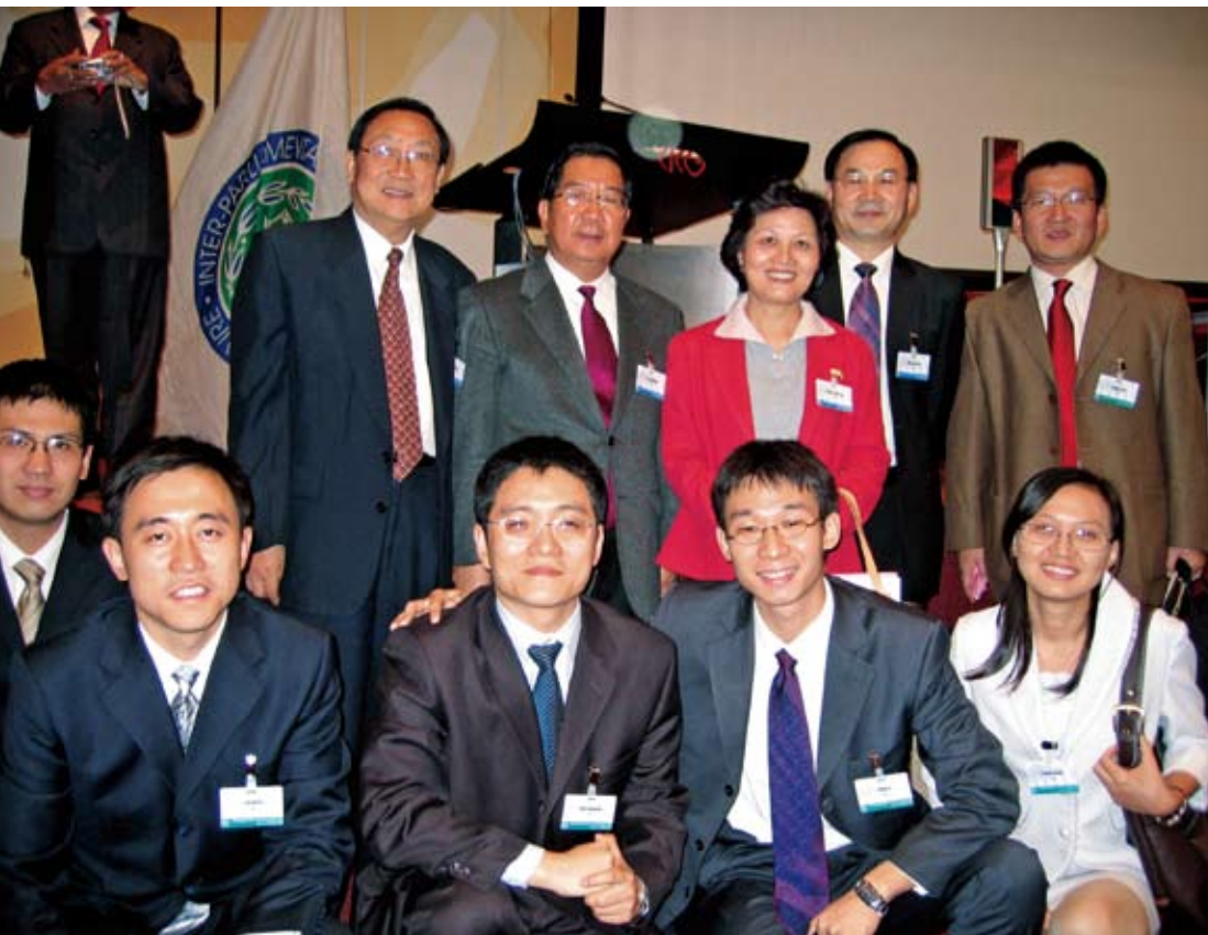
Some of the Chinese delegates attending the 117th meeting of the Inter-Parliament Union in October 2007 have a group photo taken.