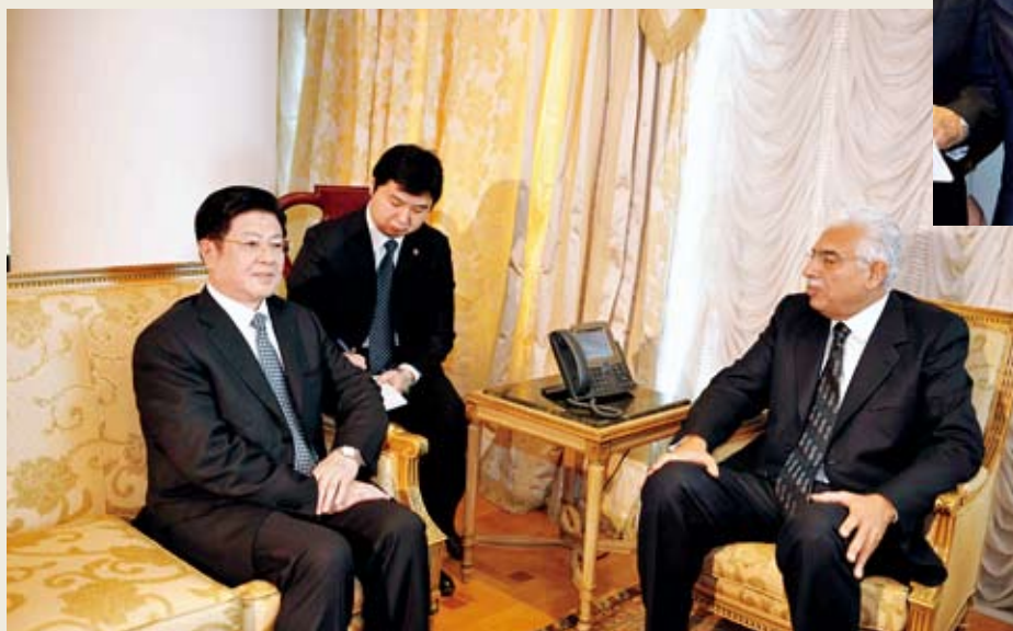
Egyptian Prime Minister Ahmed Nazif (right) meets Wang Zhaoguo, Vice Chairman of NPC Standing Committee, who was conducting a goodwill visit to Egypt, on March 25.