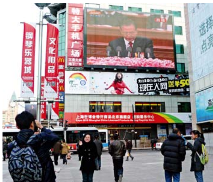
Passersby at the Wangfujing Street watch a live TV broadcasting of the work report made by Premier Wen Jiabao.

In the 36-page work report, the word “innovation” appears frequently.