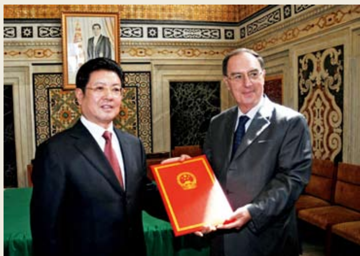
Vice Chairman of NPC Standing Committee Wang Zhaoguo (left), who is paying a goodwill visit to Tunisia, presents a gift to his Tunisian counterpart Mohamed Afif Chiboub House of Representatives on March 22.