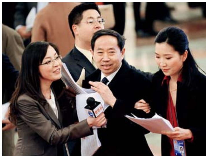
Reporters surround and interview Yuan Guiren, who is the minister of education, before he enters the Great Hall of the People on March 5.