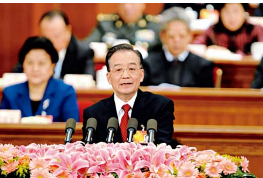
Premier Wen Jiabao delivers the government work report at the opening ceremony of the 3rd Session of the 11th NPC at the Great Hall of the People on March 5 in Beijing. Ma Zengke

M arch 13 and 14, 2010, respectively saw the conclusion of the 3rd Session of the 11th Chinese People's Political Consultative Conference (CPPCC) and the 3rd Session of the 11th National People's Congress (NPC). How to speed up the transformation of the mode of economic development in China has been the hottest topic of the Two Sessions.