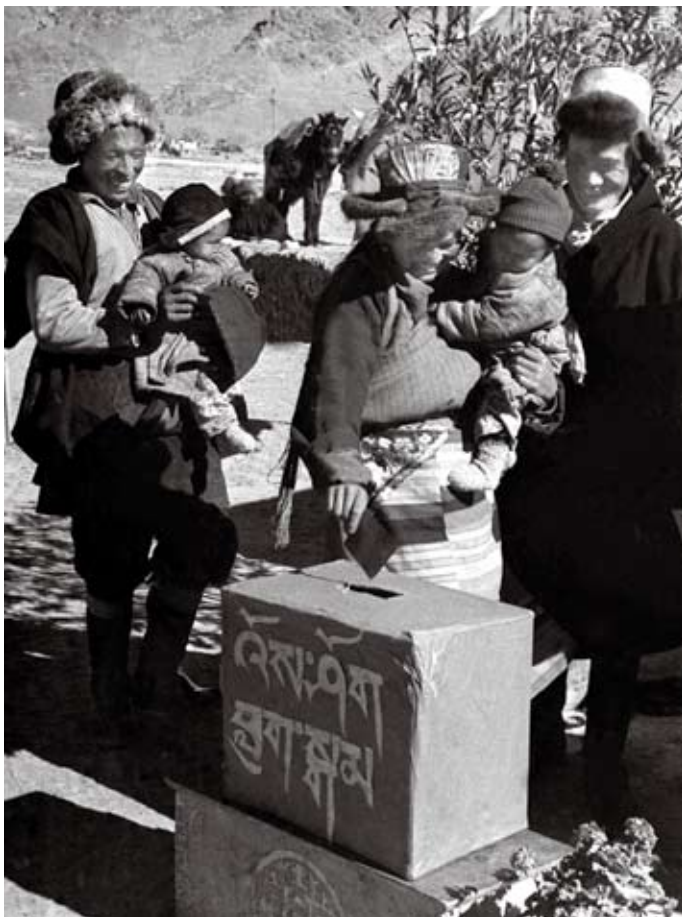
Tibetan people, breaking free from slavery system, for the first time vote for their own representatives in suburban Lhasa in 1963.