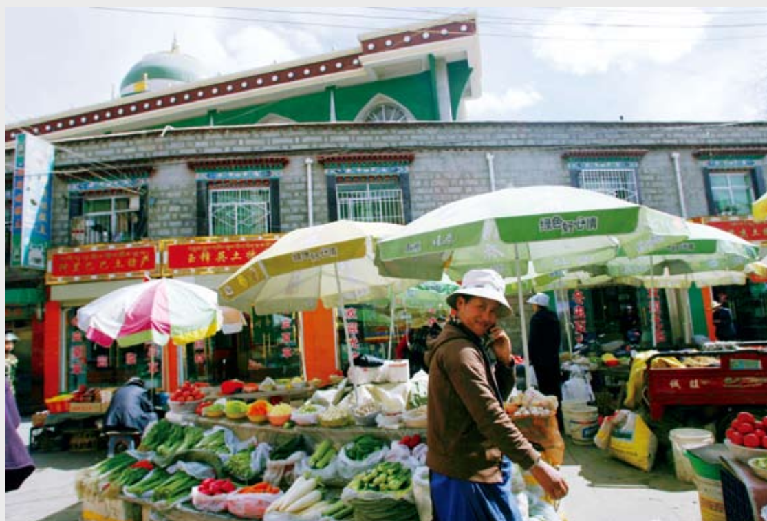
A Tibetan vegetable-stall keeper makes a phone call on March 27. A number of vegetable booths have been set up in Lhasa to provide fresh vegetables for local people.