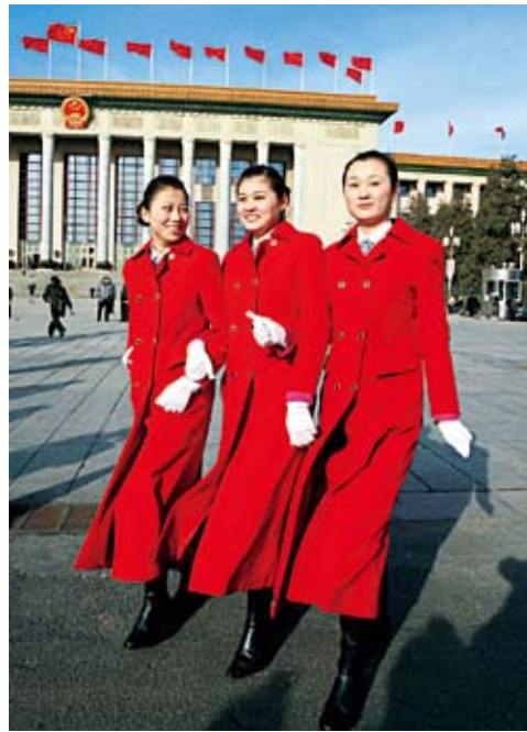
Women assistants attending the Two Sessions