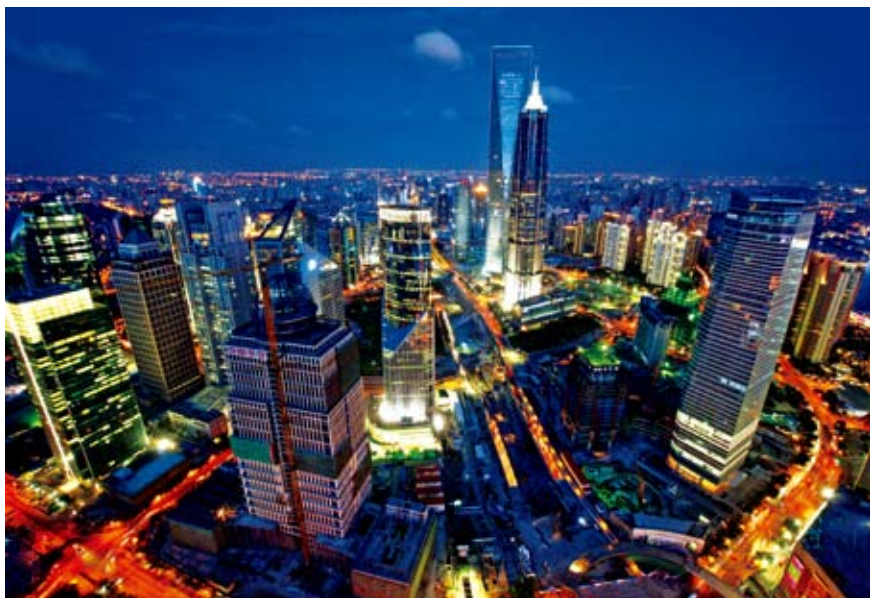
A night scene of Shanghai's Pudong New Area. Pudong takes the lead in transforming its economic growth mode.

Nothing about the interests of the people is trivial, and all concerning people’s livelihood weighs utmost. A strong message about ensuring and improving the livelihood of the people