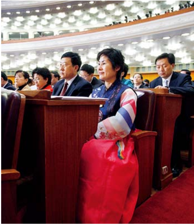
NPC deputies listen to a report during the conference.

not exercise administrative, judicial or procuratorial powers, nor do they directly deal with specific issues. Over the years, we have made tremendous efforts to strengthen and improve the oversight work of people's congresses with considerable success, created a body of effective work mechanisms and methods, and helped solve major problems that have an overall impact and are of deep concern to the people. Experience shows that oversight by people's congresses in accordance with the law helps governments, courts and procuratorates improve their work. Accepting oversight by people's congresses also facilitates governments' administration in accordance with the law as well as the impartial justice of courts and procuratorates. To properly handle their relations with governments, courts and procuratorates when overseeing their work, it is important for people's congresses to act in strict accordance with the Law on Oversight. This requires us to always uphold the approach of concentrating on core issues, identifying priorities and seeking substantive results, and constantly improve the way we carry out oversight. This year, we will intensify oversight in the following three areas.