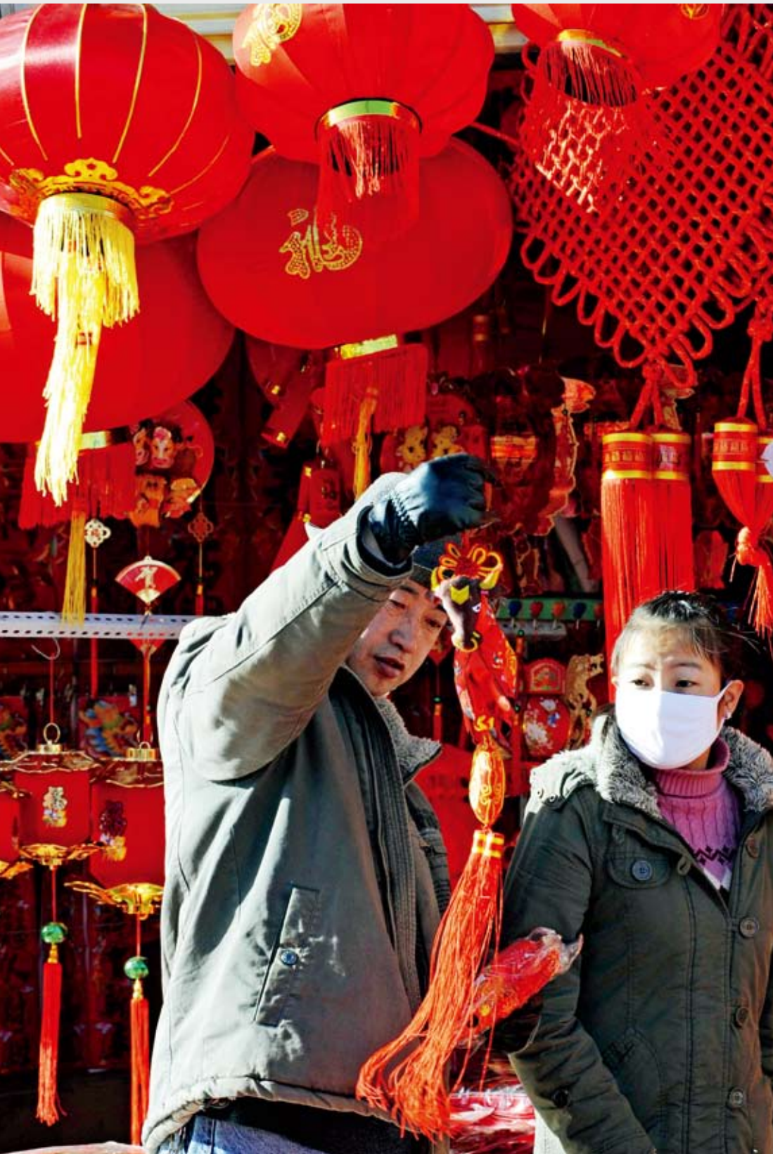
Residents of Lhasa purchase goods in the Huadeng (Flower Lantern) Street for the upcoming new year on January 21, 2009. Gesangdawa

dreds of kilometers on their knees, until they reach Jokhang Temple in Lhasa.