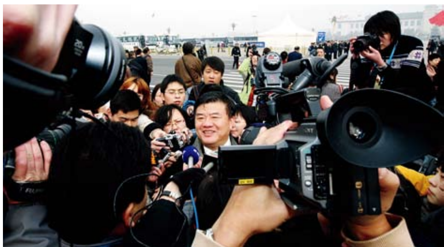
Reporters surround to interview Minister of Health Chen Zhu.