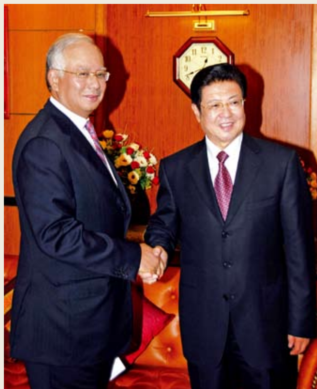
Malaysian Prime Minister Najib Razak meets Vice Chairman of NPC Standing Committee Wang Zhaoguo in Kuala Lumpur, on March 29. Malaysia is the last leg of Wang's three-country goodwill visit.