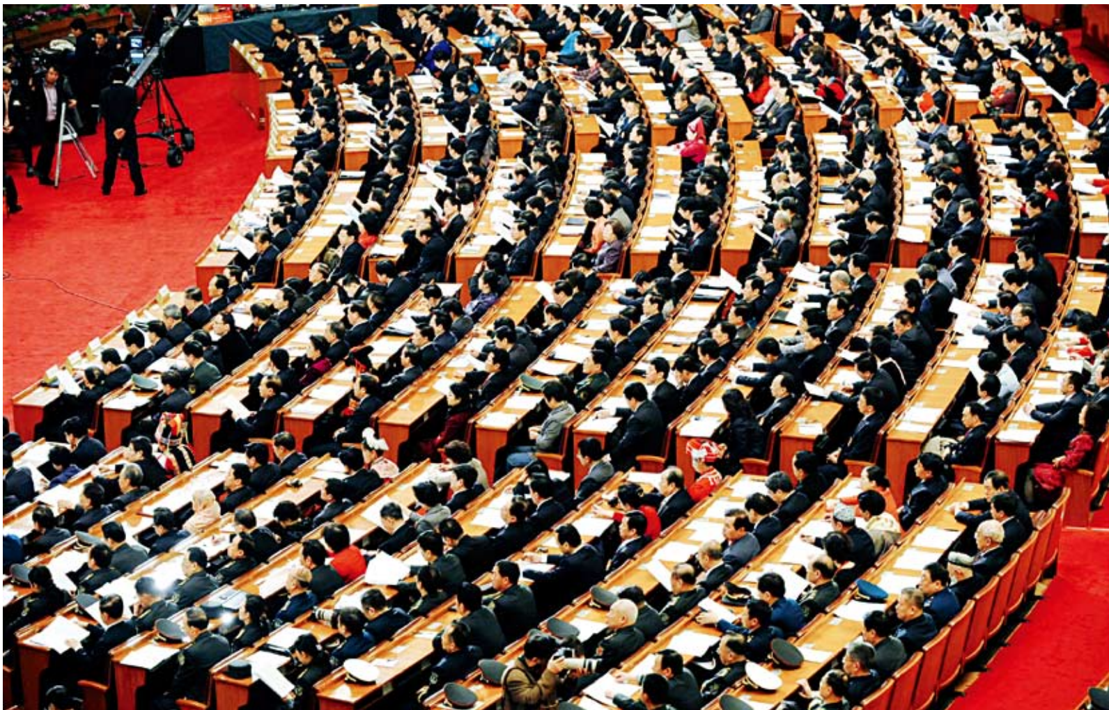
NPC deputies listen to a report during the NPC session. Ma Zengke

sumption, investment, and exports; from relying on secondary industry as the major driving force to relying on primary, secondary, and tertiary industries to jointly drive economic growth; and from relying heavily on increased consumption of materials and resources to relying mainly on advances in science and technology, a better quality of the workforce, and innovation in management. That issue was emphasized again at the Central Economic Work Conference in 2009. Accelerating the transformation of the pattern of economic development and improving and upgrading the industrial structure are important objectives and strategic measures for implementing the Scientific Outlook on Development, as well as major tasks of this year's economic work. The NPC Standing Committee needs to carry out its oversight on economic work focusing on this theme, strive to intimately integrate maintaining steady and rapid economic development with accelerating the transformation of the pattern of economic development, promote transformation in the course of development, and work for