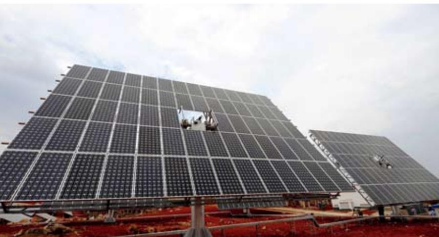
Yunnan Province in Southwest China exploits solar energy resources thanks to its abundance in sunlight. The province has accelerated its economic transformation in recent years. Li Yiguang

Irrational industrial structure makes transforming and upgrading a heavy task; low level of urbanization makes urban and