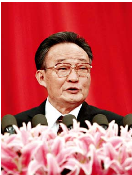
On March 9, NPC Standing Committee Chairman Wu Bangguo delivers the work report of the Standing Committee.

1) We will promptly formulate new laws. We will finish deliberating and revising the draft Social Security Law and further improve the legal system concerning social security to dispel the people's worries and better maintain social harmony and stability. We will continue to deliberate the draft Law on Administrative Enforcement and further promote government administration in accordance with the law to better safeguard the legitimate rights and interests of our citizens. We will submit for deliberation the draft VAT Law and the draft Law on Vehicle and Vessel Tax, further improve the system of fiscal and tax laws, and standardize the management of tax revenue. We will also research and formulate a people's mediation law, law on education and correction of illegal acts, law on the application of laws to civil relationships involving foreign interests, and law on the protection of our natural heritage.