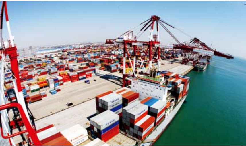
Qianwan Wharf in Qingdao, Shandong Province.