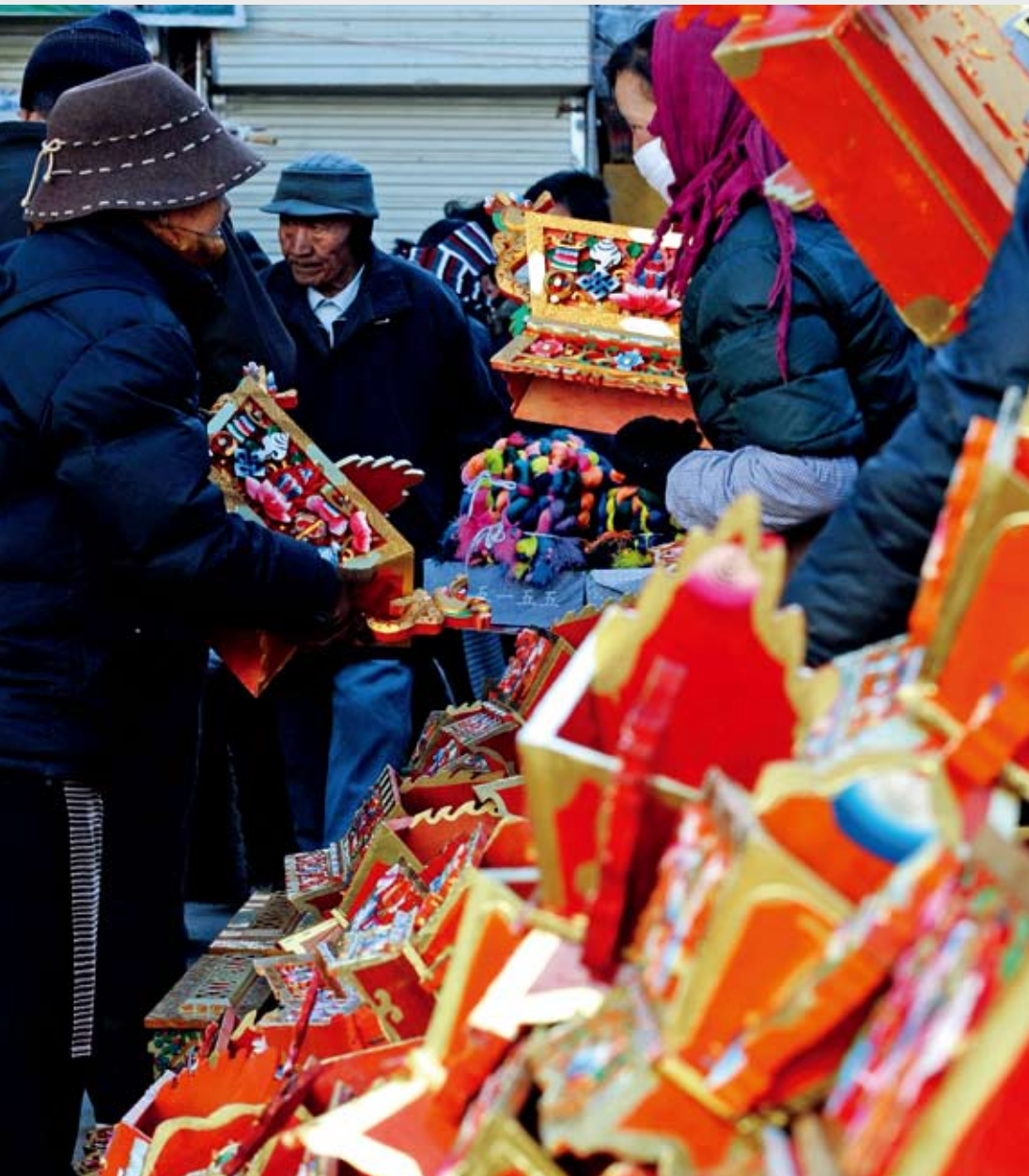
Residents in Lhasa purchase goods before the lunar new year on January 24, 2009. The abundant provision of goods in the city has ensured prices to maintain stable during the festival days.