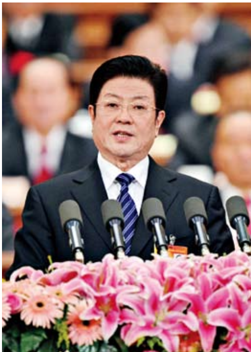
The 3rd Session of the 11th National People's Congress (NPC) holds the second plenary conference at the Great Hall of the People on March 8, 2010. NPC Standing Committee Vice Chairman Wang Zhaoguo speaks about the amendment to the Electoral Law.

The new Electoral Law, therefore, stipulates that the quota of NPC deputies is decided by the NPC Standing Committee based on the populations of each province, autonomous region and municipality, with each deputy representing equal number of urban or rural residents. The law also makes sure each area,