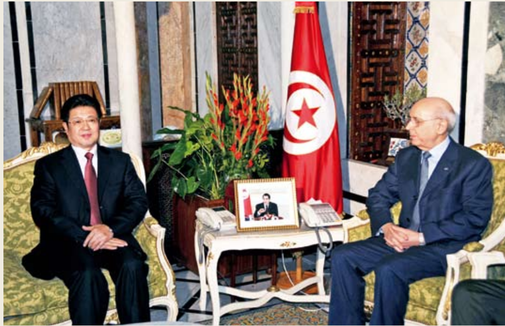
Prime Minister of Tunisia Mohamed Ghannouchi (right) meets Vice Chairman of NPC Standing Committee Wang Zhaoguo, who is paying a goodwill visit to the African country.

Headed by Vice Chairman of the NPC Standing Committee Wang Zhaoguo, a NPC delegation paid a goodwill visit to Tunisia, Egypt and Malaysia on March 19-30 at the invitation of the parliaments of the above-mentioned countries.