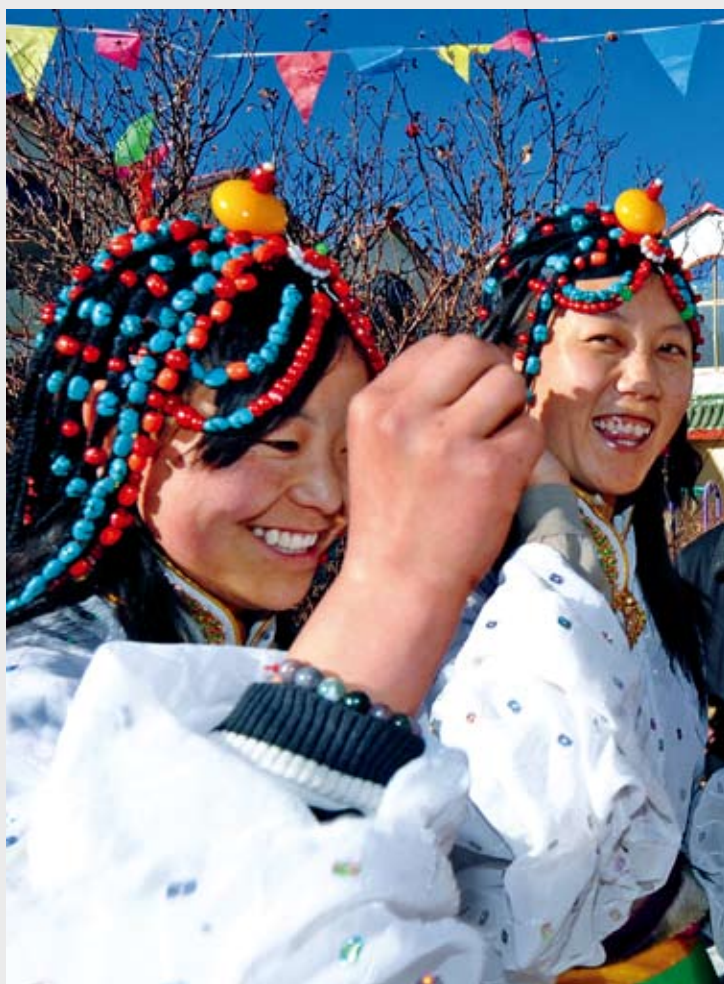
Two Tibetan girls celebrate the Tibetan traditional new year on February 14.

It is along the National Highway 109 from Lhasa to Xining, with snow-topped Mount Tanggula as the backdrop and the occasional appearance of crystal brooks on its slopes. For those travelling in a car, merely stepping out into the open is painful—the air is thin; and the wind biting. Some, however, in order to be as holy as the plateau, prostrate themselves millions of times, proceeding for hun-