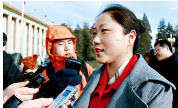
Reporters conduct an interview with NPC deputy Zhu Xueqin, who represents the massive migrant workers.