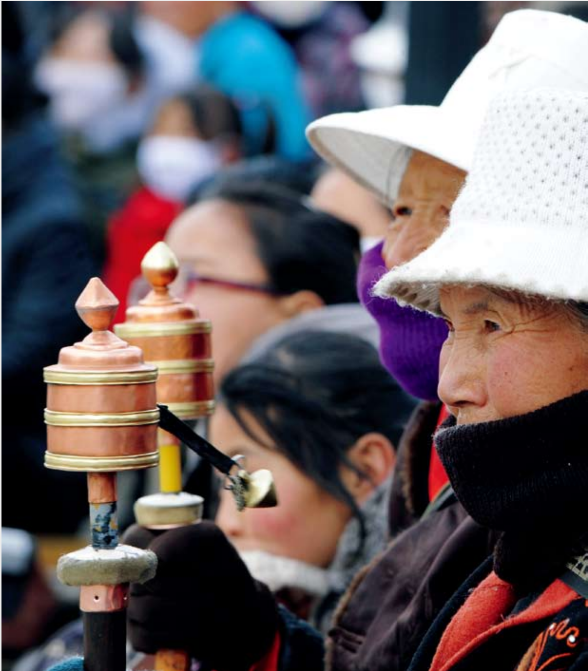
Residents in Lhasa enjoy a Tibetan opera at the Longwangtan (Dragon King) Park in Tibet on February 25.