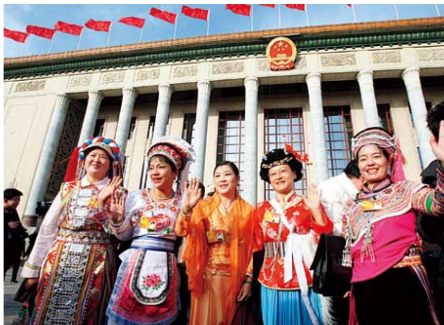
NPC deputies of ethnic minorities have a group photo taken before the Great Hall of the People.

3) We will focus on making oversight more effective, and further improve oversight methods. Oversight powers are important powers granted to people's congresses by the Constitution and laws. Oversight by people's congresses carries the force of law and is carried out in the name of the country and the people. People's congresses exercise their oversight powers collectively in accordance with the law and prescribed procedures. They do