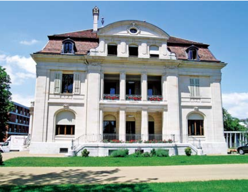
Headquarter of the Inter-Parliament Union in Geneva. File photo

It pointed out that the purpose of the US' decision was to reject China's application and then accept Chiang' group for joining IPU. Another purpose of the activity was to accept "two Chinas" to join the IPU and therefore pave way for the scheme of "two Chinas". The 3,000-word article also noted that only the people's delegation from PRC can represent China to join the IPU, just like the only representative in the UN was the government of PRC. IPU should accept PRC's application other than postponing it. The establishment of PRC's delegation was in accordance with the rules of IPU. The article appeared timely, producing great influence in the society.