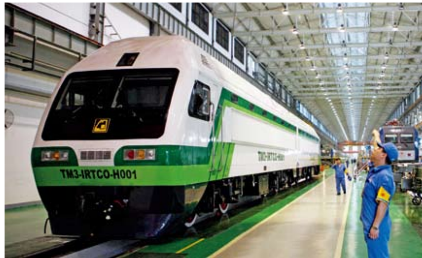
Workers of the China South Locomotive & Rolling Stock Co. Ltd work at the general assembly workshop of electric locomotives. Electric locomotives have played an important role in the development of railways in Central Asia. In recent years, China has sped up its economic transformation. Li Ming

In 30 years of reform and opening up, China's economy has created a development miracle which attracts worldwide atten-