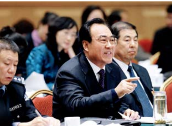
NPC deputy Du Shanxue, who is also the mayor of Changzhi in Shanxi Province, makes a speech when deliberating the government work report on March 5. CFP