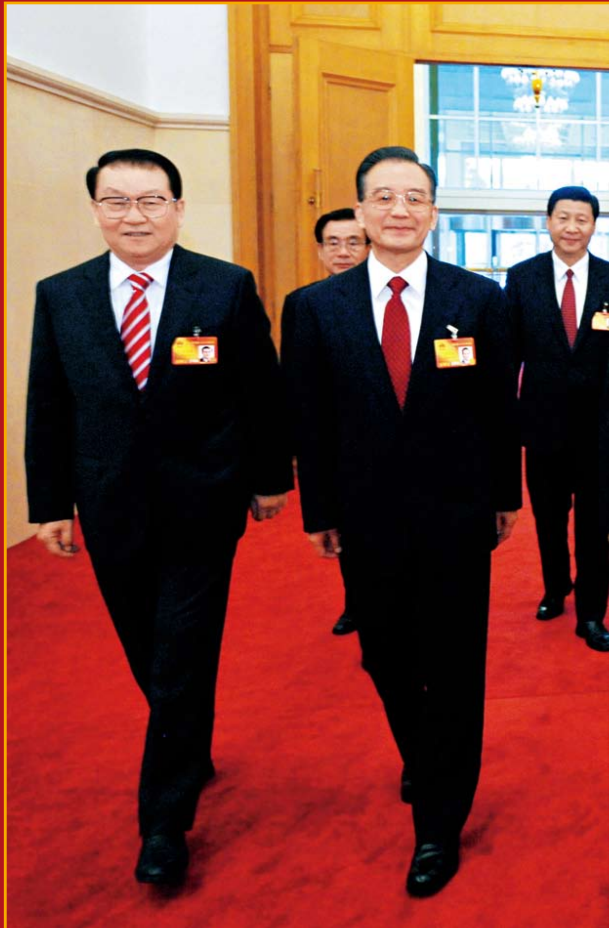
The 3rd Session of the 11th NPC opens at the Great Hall of the People on March 5 in Beijing. State leaders including Hu Jintao, Wu Bangguo, Wen Jiabao, Jia Qinglin, Li Changchun, Xi Jinping, Li Keqiang, He Guoqiang and Zhou Yongkang step into the venue.