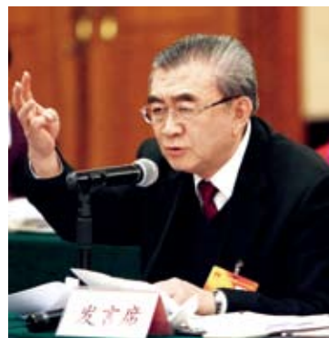
NPC deputy Wang Zhenhua, who is also the Chief Justice of Liaoning Provincial High People's Court, proposes to pragmatically implement the Judges Law on March 12. Ju Peng