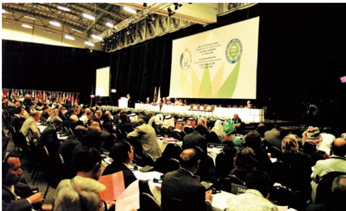
Venue of the 118th Conference of the Inter-Parliament Union in South Africa’s Cape Town in April, 2008.

On August 30, a front-page editorial entitled “Solemn protest from the Chinese people” appeared on the People’s Daily.