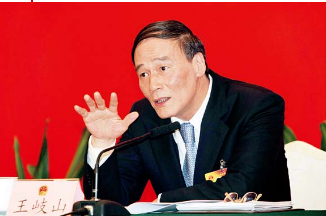
Vice Premier Wang Qishan, together with NPC deputies from Shandong Province, discuss the government work report on March 5.