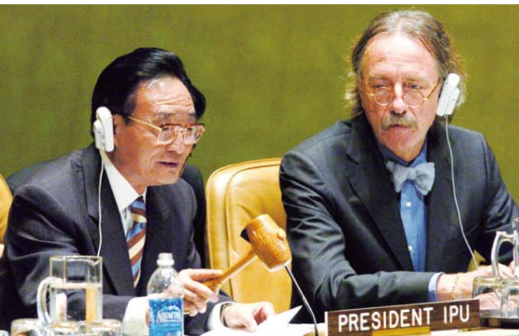
Chairman of NPC Standing Committee Wu Bangguo (left) chairs the plenary meeting at 5-6 pm of the 2nd World Conference of the Speakers of Parliament at the UN headquarters in New York City on September 7, 2005. During the three-day meeting, Wu was nominated as the first deputy chairman of the conference.