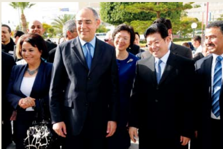
Vice Chairman of NPC Standing Committee Wang Zhaoguo (second from right) and Samir Laabidi (second from left), who is the minister of youth and sports, watch a painting show by Tunisian children on March 22. A picture exhibition themed on the Shanghai Expo was held in the city of Tunisia, capital of Tunisia.