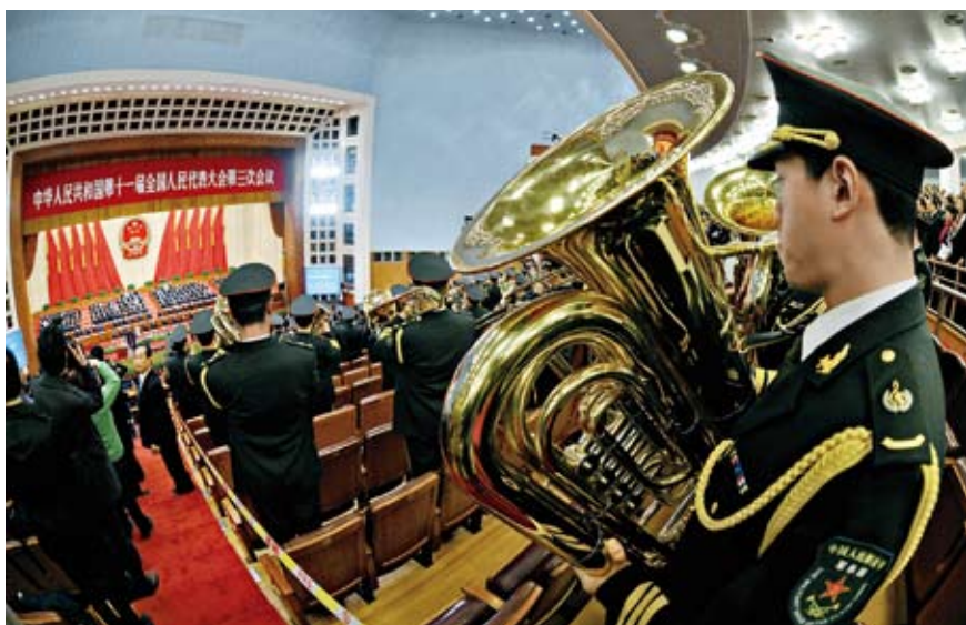
On March 5, 2010, the 3rd Session of the 11th NPC opens at the Great Hall of the People in Beijing. The military band plays music during the opening ceremony.

He said supervision of extorting confessions by torture, overdue detention and other acts that infringe people's interests, should be enhanced and judicial guarantee of human rights