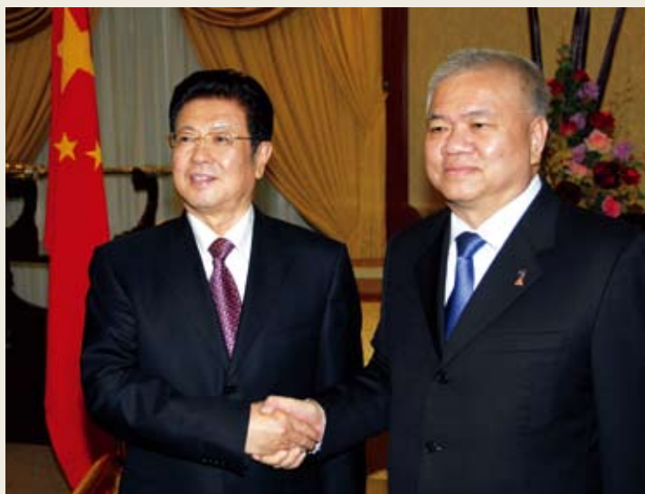
Wong Foon Meng, speaker of the upper house of Malaysia, meets visiting Vice Chairman of NPC Standing Committee Wang Zhaoguo (left) in Kuala Lumpur on March 29.