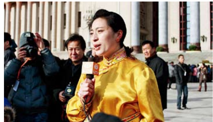
A female Tibetan reporter conducts an on-the-spot interview in front of the Great Hall of the People. Zhang Weiwei