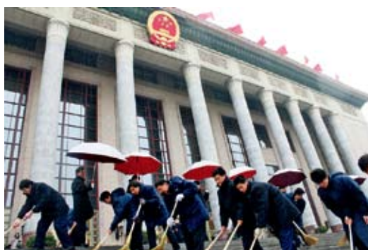
Staff of the Great Hall of the People clean the snow outside of the venue, where the 3rd Session of the 11th NPC was held, on March 14. Yu Hao