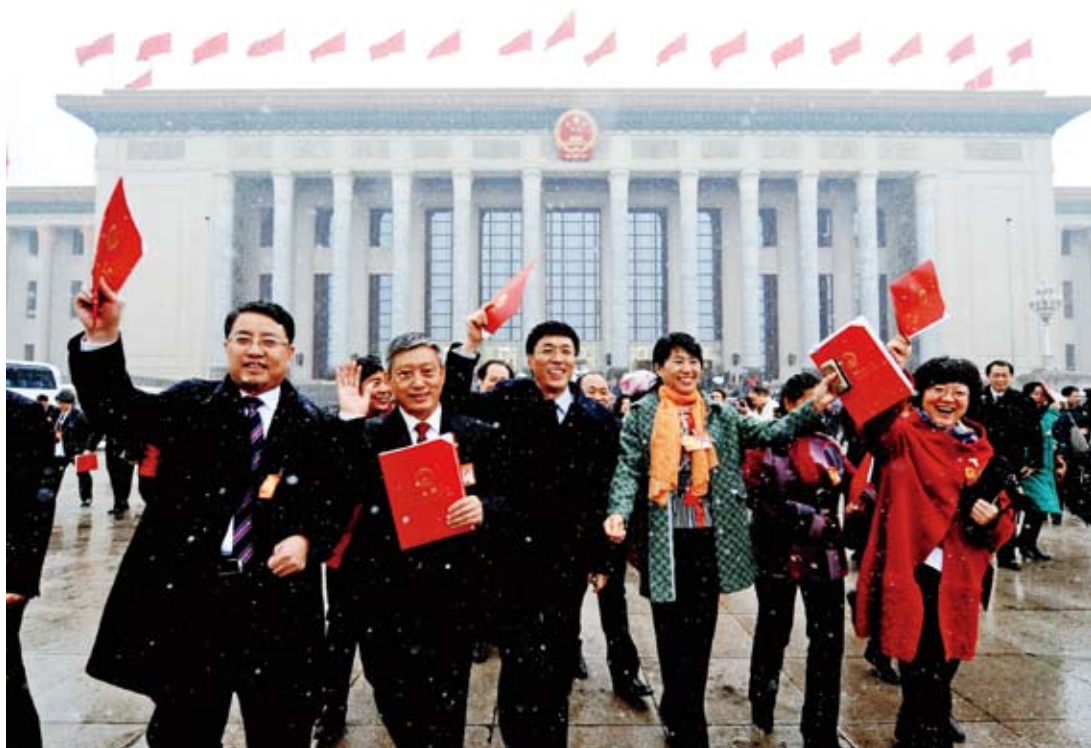
Deputies walk out of the Great Hall of the People after the closing ceremony of the 3rd Session of the 11th NPC on March 14.