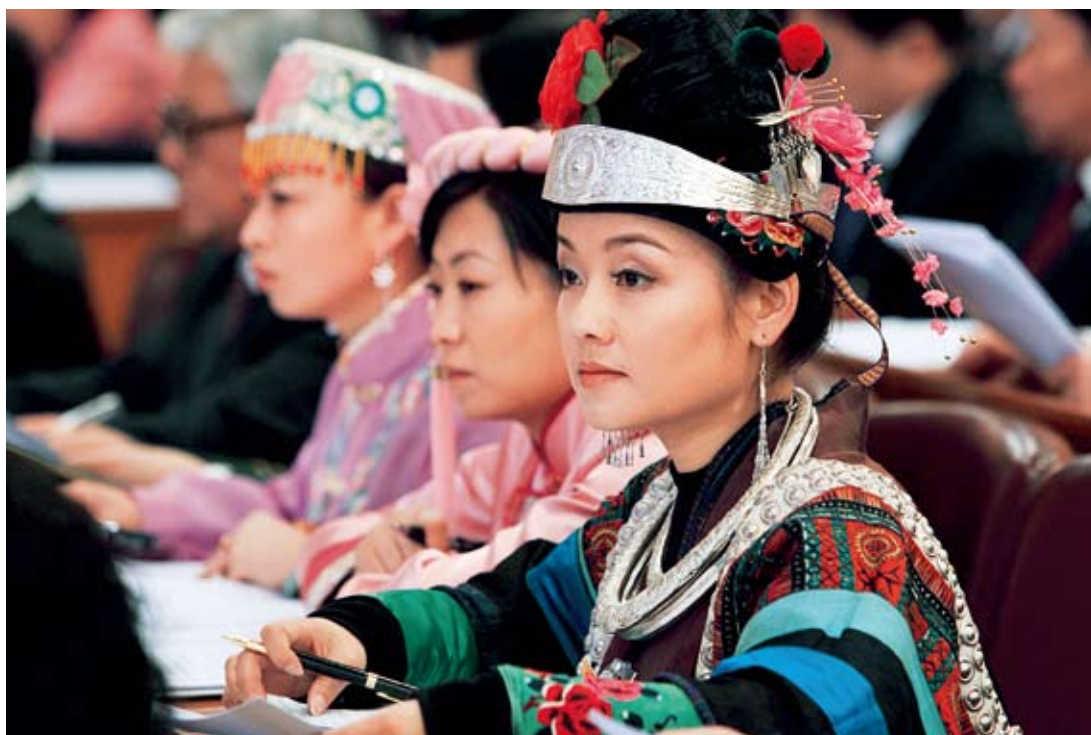
NPC deputies of ethnic minorities attend the closing ceremony of the 3rd Session of the 11th NPC on March 14.