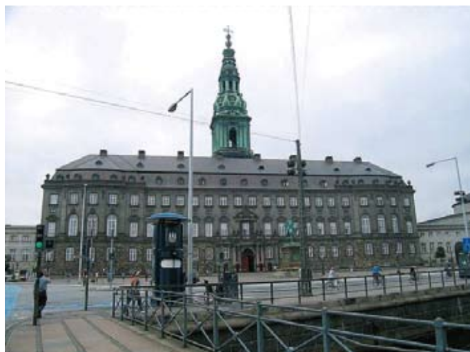
The Parliament Building of Denmark in Copenhagen. File photo