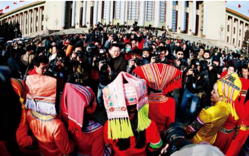
Reporters covering the ongoing Two Sessions take photos of NPC deputies of ethnic minorities, attending the 3rd Session of the 11th NPC at the Great Hall of the People in Beijing.

ternoon at the Third Session of the 11th National People's Congress. The following are the highlights of Cao's report: