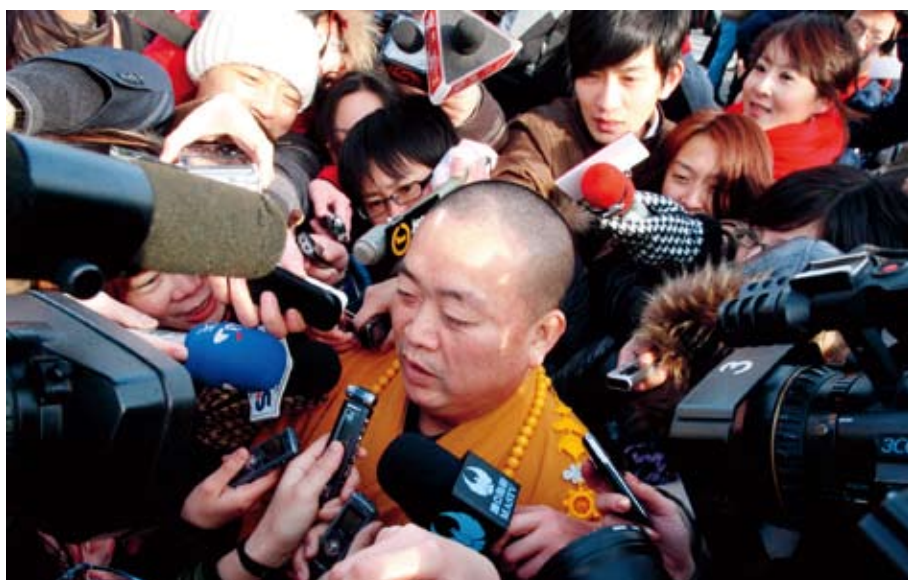
A cluster of reporters surround NPC deputy Shi Yongxin, who is also the abbot of Shaolin Temple in Henan Province, in front of the Great Hall of the People on March 5.