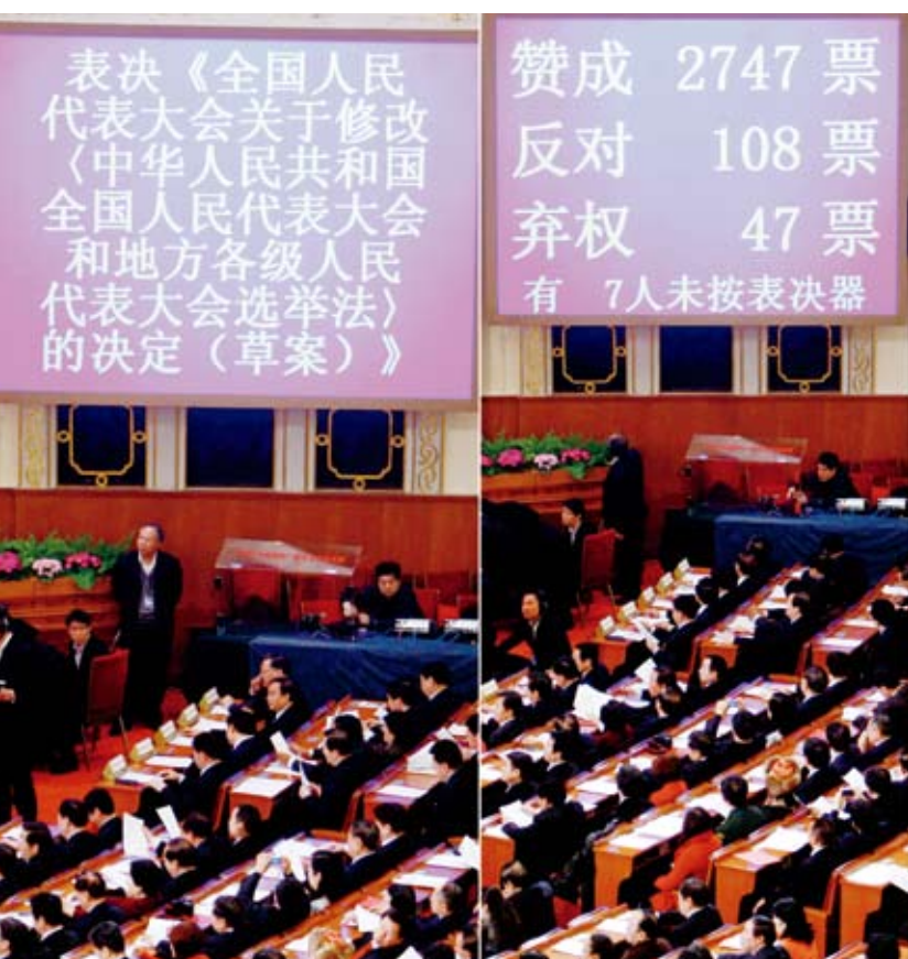
NPC deputies vote to approve the amendment to the Electoral Law. On March 14, 2010, the closing ceremony of the 3rd Session of the 11th NPC was held at the Great Hall of the People. Deputies took votes on eight drafts and resolutions, including the government work report delivered by Premier Wen Jiabao. Du Yang

The NPC also approved work reports of the government, the NPC Standing Committee, the Supreme People's Court and the Supreme People's Procuratorate. The NPC also endorsed the central and local budgets, and the report on economic and social development.