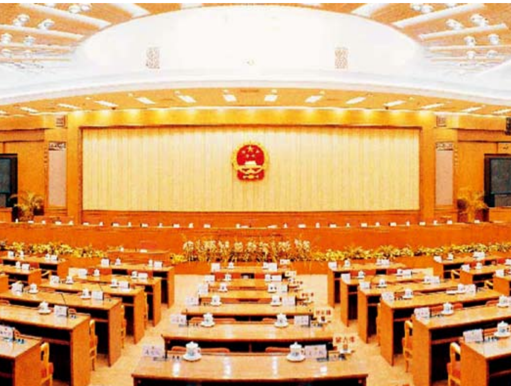
The Conference Hall of the NPC Standing Committee