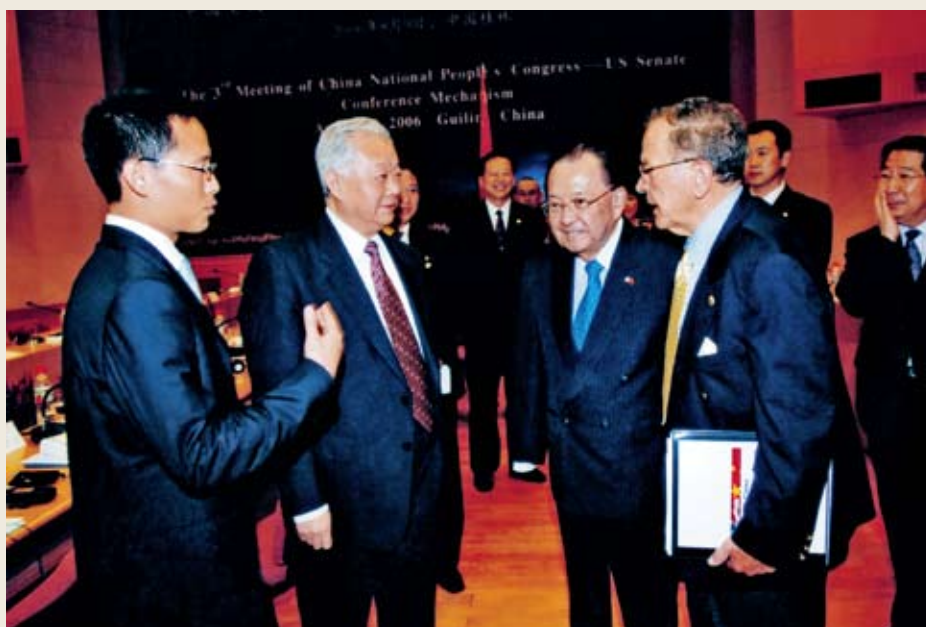
US Co-Chairmen Theodore Stevens (first from right, front row) and the Senator Inouye (Front Row, second from right) attend the third regular meeting between China's NPC and the US Senate on August 9, 2006.

The purpose is to enhance mutual understanding, narrow differences and reach consensus on some major issues.