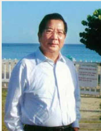
Lu Congmin, vice chairman of the 10th National People's Congress Foreign Affairs Committee