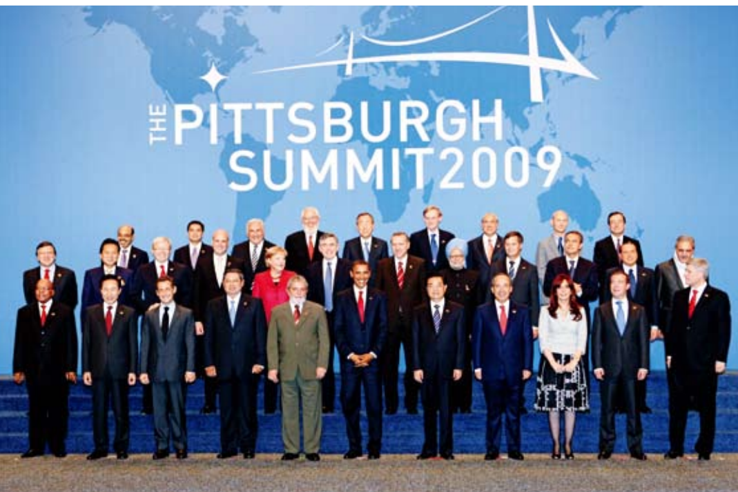
Chinese President Hu Jintao poses for a group photo with other leaders and participants attending the Group of 20 Financial Summit in Pittsburgh, the United States. President Hu delivered an important speech on September 25, 2009.

Chinese President Hu Jintao on September 25 called on world leaders to make every effort to promote global economic growth and a comprehensive, balanced and sustainable socioeconomic development.