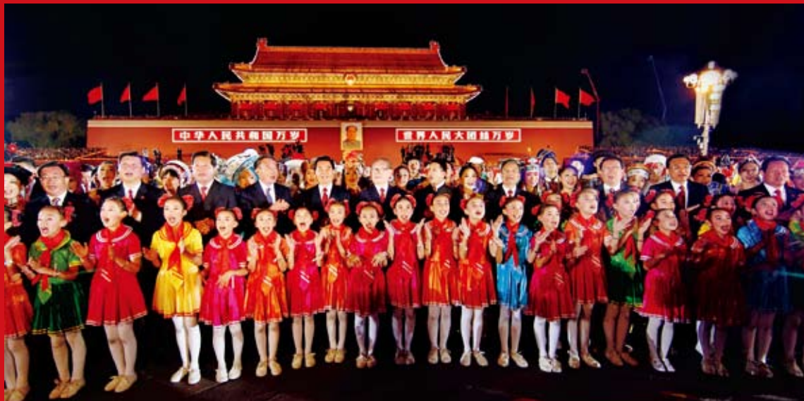
Party and State leaders, together with mass of people, join the National Day celebrations. Li Xiaoguo