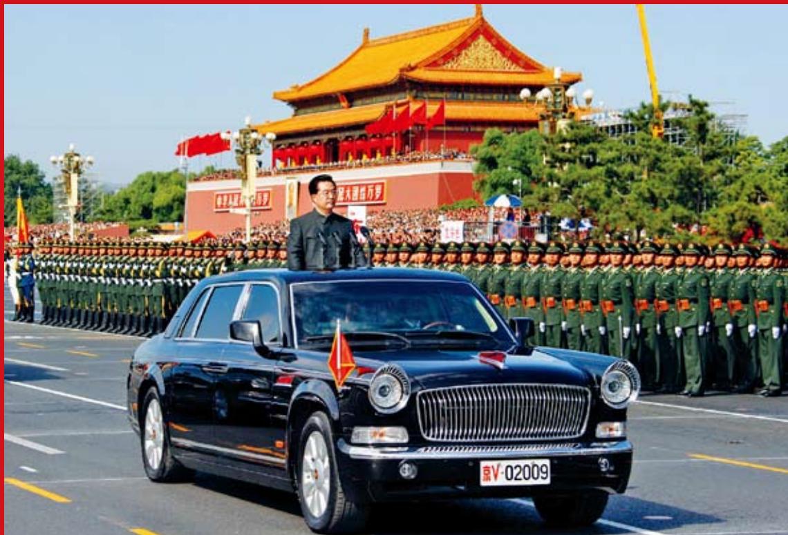
Hu Jintao, general secretary of the Central Committee of the Communist Party of China, Chinese President and chairman of the Central Military Commission, goes by car inspecting troops of the Chinese People's Liberation Army that take part in the military parade for celebration of the 60th anniversary of the founding of the People's Republic of China on October 1, 2009. Wang Jianmin