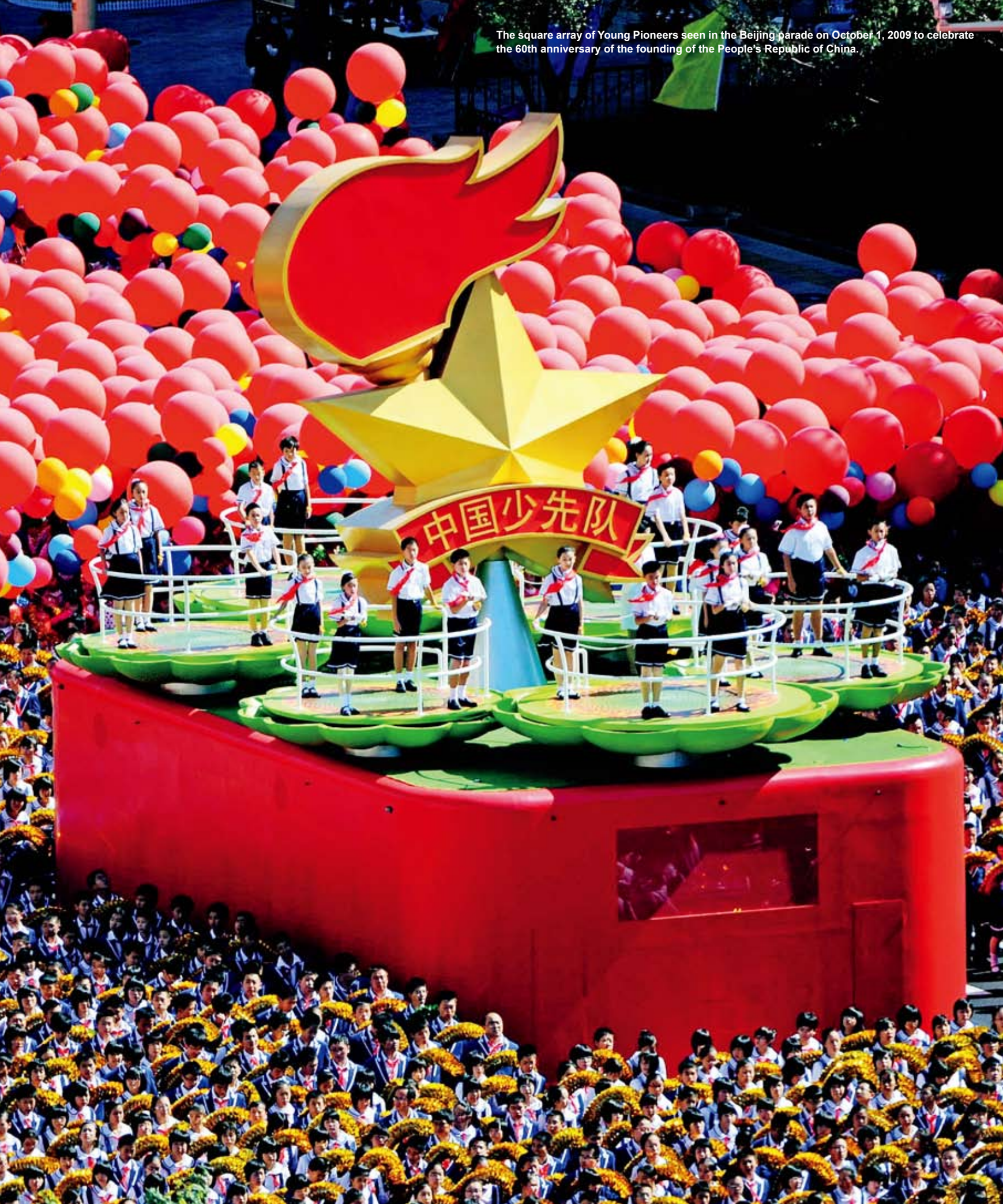
The square array of Young Pioneers seen in the Beijing parade on October 1, 2009 to celebrate the 60th anniversary of the founding of the People's Republic of China.