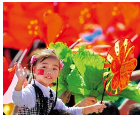
A grand gala is held on October 1 evening to mark the 60th anniversary of the founding of the People's Republic of China.

A girl parader waves hands to audience.