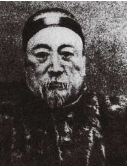
At the age of 68, General Zuo Zongtang vowed to take back Ili, which was occupied by Russia. To show his solid determination, Zuo demanded his army to take a coffin for him.

M asterminded, instigated and organized by overseas separatists, the July 5 riots in Urumqi as well as the follow-up syringe incidents in Xinjiang Uygur Autonomous Region had produced severely adverse impact on the whole society. Under the strong leadership of the Communist Party of China (CPC) Central Committee and the State Council and with the joint efforts of all ethnic groups in Xinjiang, the regional CPC Committee and government have taken resolute actions to crack down on violent crimes and maintain social stability.