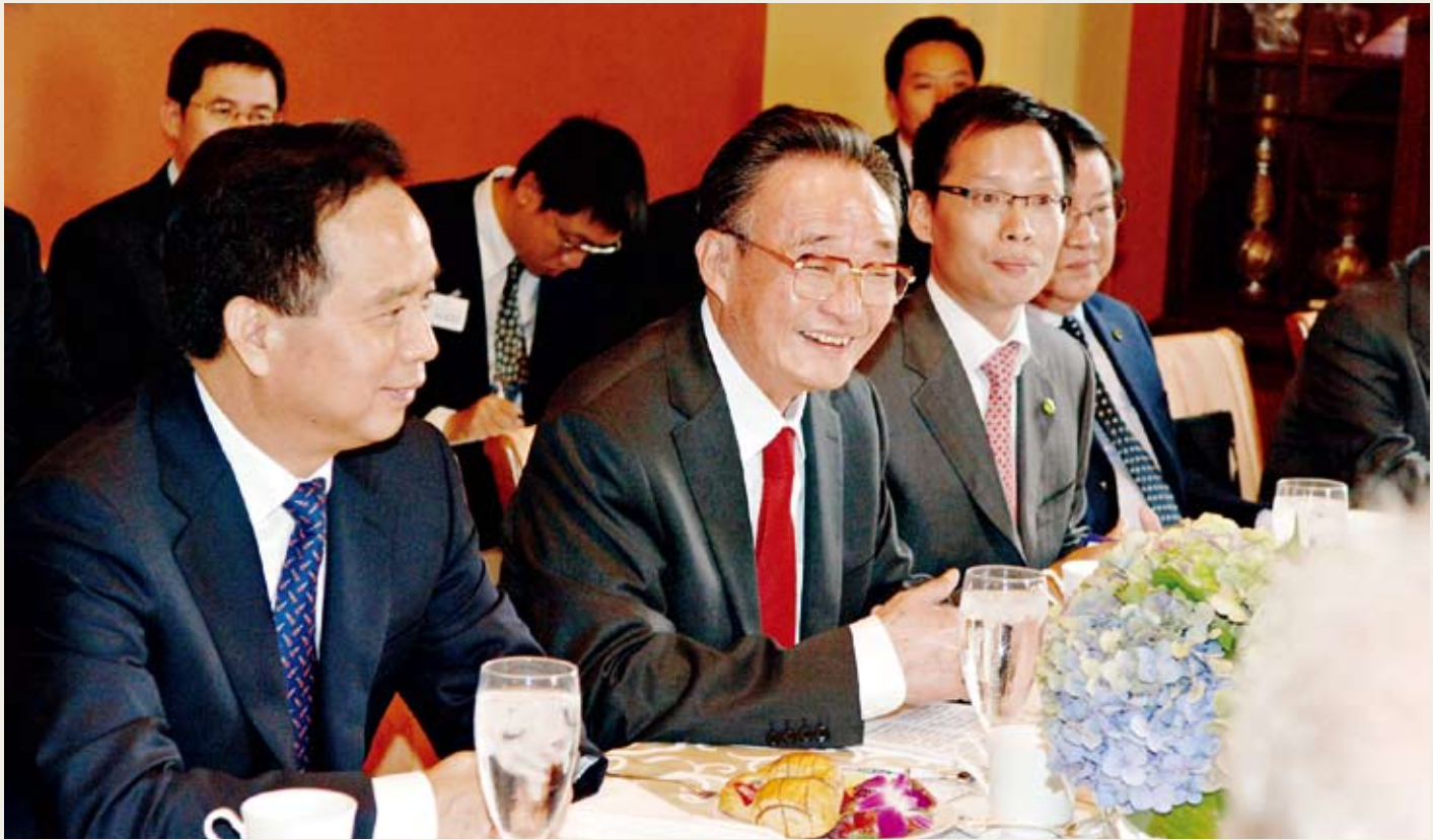
NPC Standing Committee Chairman Wu Bangguo and ViceChairman and Secretary-general Li Jianguo, meet the US House of Representatives Speaker Nancy Pelosi.

have kept close contacts with China. The statistics comes from the congressmen, and it may not be very precise. All in all, few congressmen truly understand China. And the newly-elected barely had any contact with us. Few congressmen hold extreme views about China. Their number may be limited, but their impacts are certainly not neglectable. They have been the troublemakers in Sino-US relations. Third, after 30 years of endless effort, the number of congressmen who would like to come to China, to know China, and promote Sino-US relations is increasing. This has provided us with more opportunities. We never reject a congressman's expressed desire to visit China. And their visits are bringing positive feedbacks.