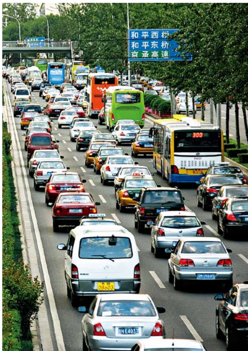
From July 1, 2008, vehicles, whose weight is below 3.5 tons and whose tail gas emission cannot meet the national III standards, will not be registered, according to a notice released by the National Development and Reform Commission. CFP

To combat climate change, we must further implement the scientific development outlook. The recently-closed 10th meeting of the 11th NPC Standing Committee passed the Resolution on Making Active Responses to Climate Change. With a spirit of being highly responsible for the survival and long-term development of mankind, China pledges to boost awareness of combating climate change and set proper policies and measures to win this battle. ■