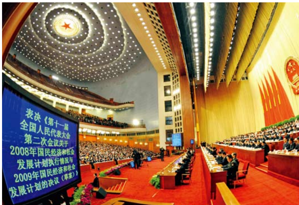
The Grand Auditorium of the Great Hall of the People.

It witnesses the happening of major political affairs since the founding of New China in 1949. More important, it has weathered all the changes of the nation.