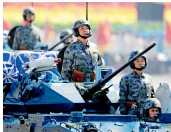
Parachute soldiers in armored vehicles attend the grand military parade for celebration of the 60th anniversary of the founding of People's Republic of China on October 1.

A girl parader waves hands to audience.