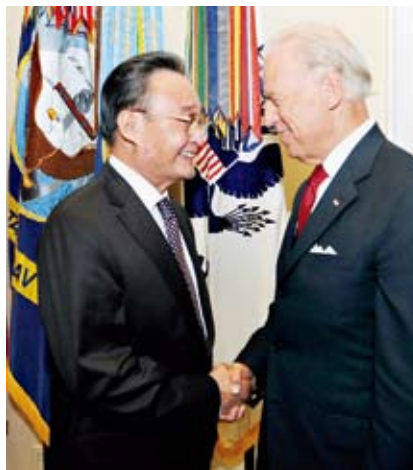
Wu Bangguo (left), chairman of the 11th NPC Standing Committee, meets US Vice President Joe Biden at the White House on September 10, 2009.

Thirty years have passed since China and the US established diplomatic relations. Three decades of development has fostered