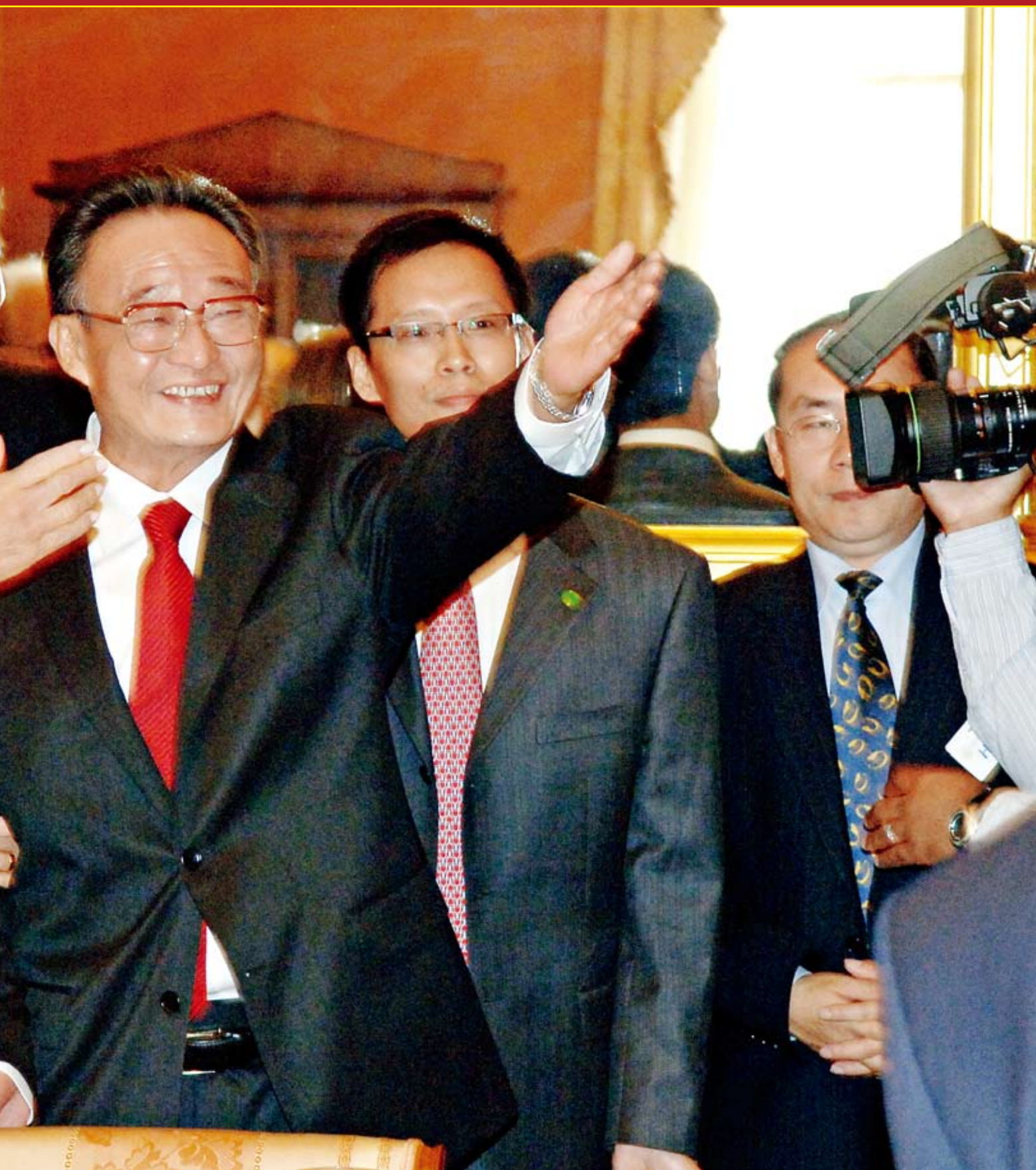
NPC Standing Committee Chairman Wu Bangguo meets Nancy Pelosi, speaker of US House of Representatives, on September 9, 2009.