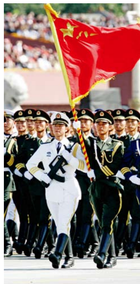
Escorting the national flag, the honor guards of the People's Liberation Army (PLA) march before the PLA troops that take part in the military parade for celebration of the 60th anniversary of the founding of People's Republic of China on October 1. Zhang Yu.