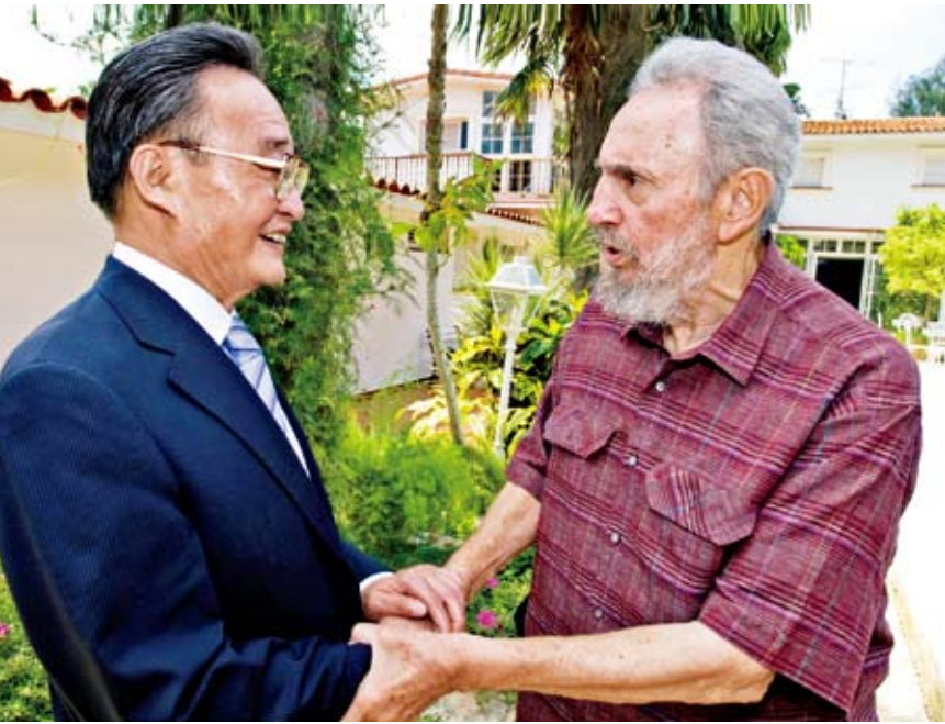
NPC Standing Committee Chairman Wu Bangguo visits Fidel Castro (right), first secretary of the Central Committee of the Communist Party of Cuba, in Havana, capital of Cuba on September 3, 2009. Pang Xinglei

in the spirit of mutual respect, seeking common ground while reserving differences and win-win cooperation.