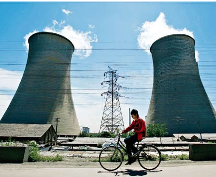
Xu Dingming, former director general of the Energy Bureau, National Development and Reform Commission, says on the China's Energy Strategy Forum, to save energy and to reduce emission of greenhouse gas and development of new energy industries are crucial for the country's development despite the financial crisis in the world.

Environment Protection and Resource Conservation Committee. Climate change is related to the overall survival and development of humankind. Starting from the 1970s, the international society has taken counter measures and mapped out a series of strategies.