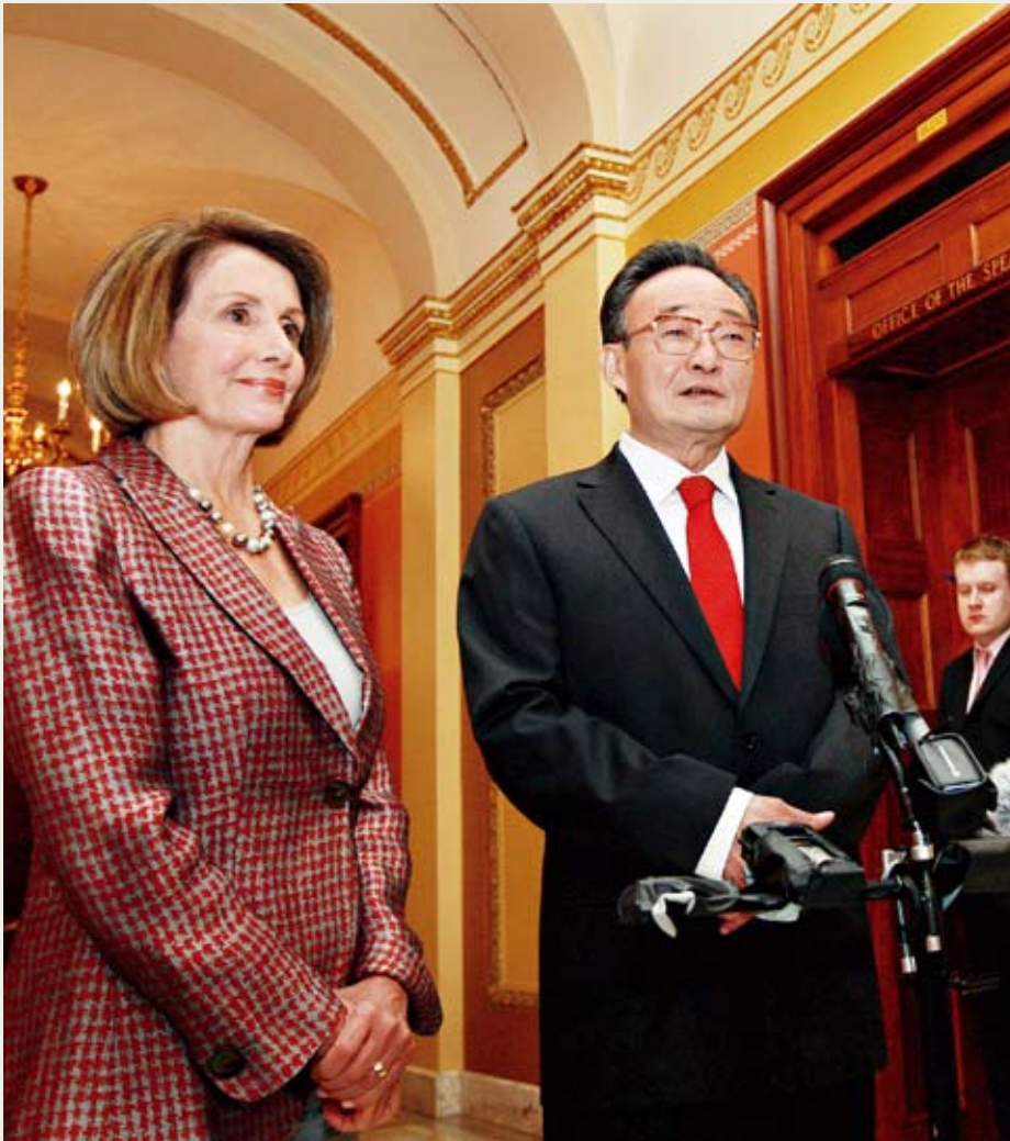
September 9, 2009, NPC Standing Committee Chairman Wu Bangguo meets the US House of Representatives Speaker Nancy Pelosi.

one simple truth. That is dialogue is better than conflict. She said she comes to China with friendship, praised China of its achievements in development and participation in international affairs. She said she admires the Chinese people. Human right issue is her lasting topic. She did bring up the subject, but she didn't focus on the matter. She said human right is an issue in Sino-US relations and the US is concerned about it, but she said the US will deal with it in a dialogue manner rather than a conflict manner. Third, the main task for her visit is climate change and energy cooperation. To explore cooperative potentials in facing these common challenges is her top priority. After analyzing her recent activities in Washington, we draw one conclusion: Pelosi comes to talk about issues of great importance and top priority. These issues concern key policies for the Obama administration. They are also the priorities of Pelosi and the Congress. Once she comes to China to seek cooperation, she should talk more about common interests. She understands perfectly about this. The change in her attitudes, or rather the changes in the general picture, reflects a new tendency in the adjustment of US foreign and domestic policies, and its realistic consideration in the global financial crisis. At the same time, it reflects China's uniqueness and special influence on international politics.