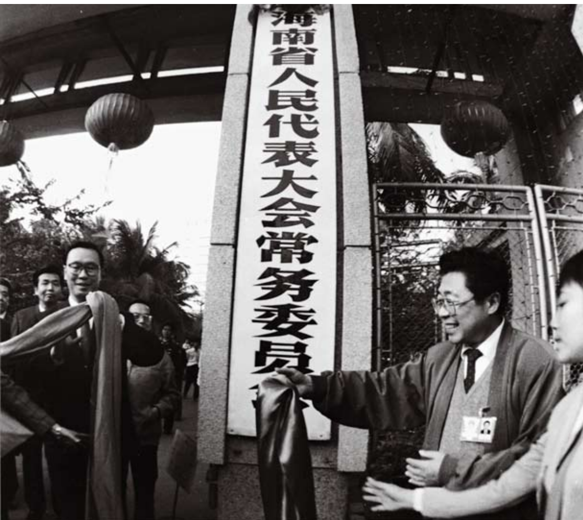
The Standing Committee of Hainan Provincial People's Congress starts operation on February 4, 1993. File photo

On May 3 of 1979, Peng raised two points during a conversation with other colleagues. First, it is self-contradictory to define the Revolutionary Committee as the standing body of people's congress and meanwhile define it as government. The Revolutionary Committee was the product of the Cultural Revolution and cannot co-exist with the legislation. It is logic to change the name of Revolutionary Committee to People's Council. Second, the establishment of the standing committees of the people's congresses at county level and above served the goal that government