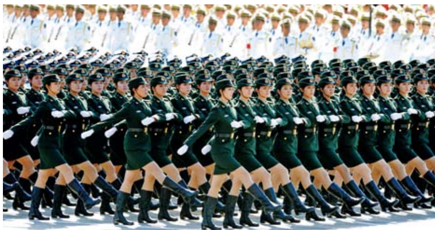
Women soldiers attend the PLA troops that take part in the military parade for celebration of the 60th anniversary of the founding of People's Republic of China on October 1. Yang Lei

Paraders holding a huge "national flag", a "national emblem" and a banner that reads "Guoqing (national celebration) 1949-2009" walk ahead of other people attending the mass parade to mark the 60th anniversary of the founding of the People's Republic of China. Yang Lei