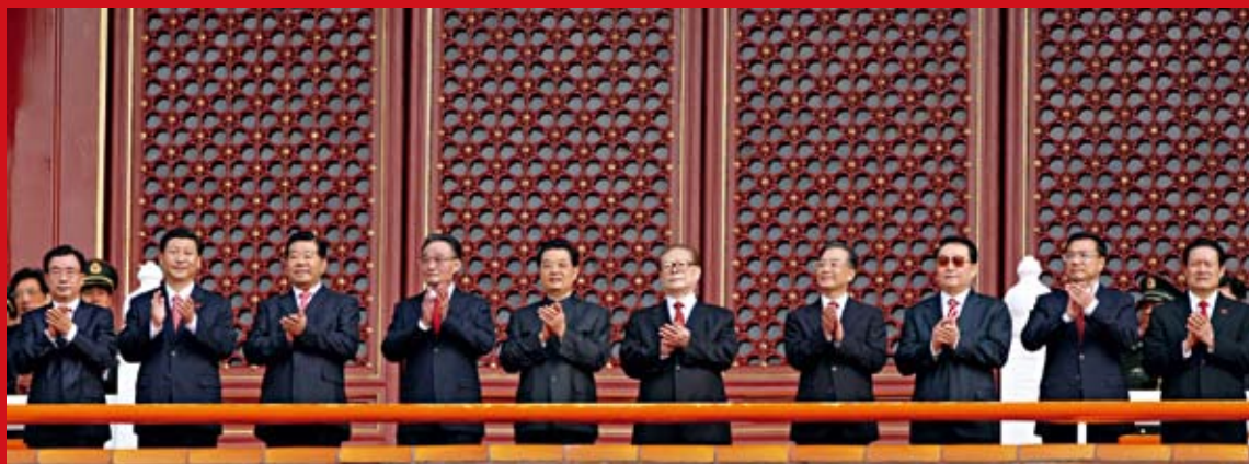
Party and State leaders Hu Jintao, Jiang Zemin, Wu Bangguo, Wen Jiabao, Jia Qinglin, Li Changchun, Xi Jinping, Li Keqiang, He Guoqiang and Zhou Yongkang appear at a grand mass gala to mark the 60th anniversary of the founding of the People's Republic of China at the Tiananmen Square on October 1, 2009.