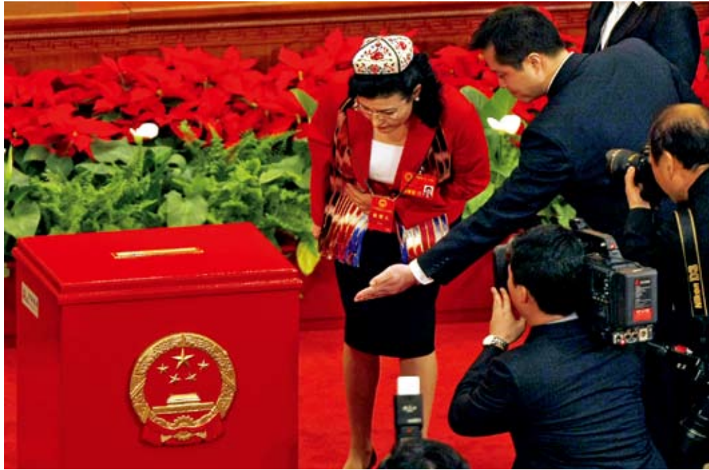
The Great Hall of the People is equipped with world-class electronic ballot boxes.

Besides of the changes of the equipment at the Great Hall of the People, more impressive and admirable are the progress that has been made on the democracy process and rule of law in China.